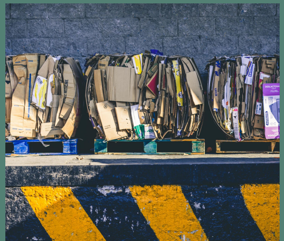
Assorted stacks of cardboard boxes.