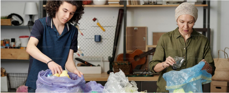
Grandmother and grandson sorting various kinds of waste into different cellophane sacks while standing by a large table in a garage.