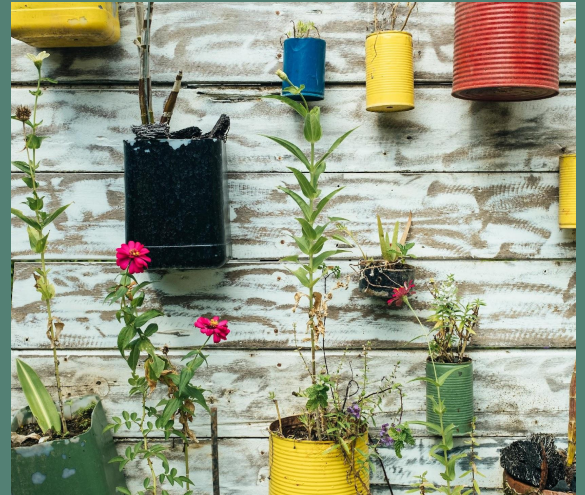
Green-leafed plants in hanging cans.

MSU is an affirmative-action, equal-opportunity employer, committed to achieving excellence through a diverse workforce and inclusive culture that encourages all people to reach their full potential. Michigan State University Extension programs and materials are open to all without regard to race, color, national origin, gender, gender identity, religion, age, height, weight, disability, political beliefs, sexual orientation, marital status, family status or veteran status. Issued in furtherance of MSU Extension work, acts of May 8 and June 30, 1914, in cooperation with the U.S. Department of Agriculture. Quentin Tyler, Director, MSU Extension, East Lansing, MI 48824. This information is for educational purposes only. Reference to commercial products or trade names does not imply endorsement by MSU Extension or bias against those not mentioned.